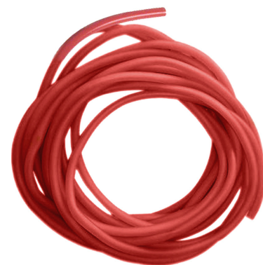
Silicone Rubber Tubing