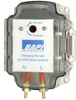
Differential Pressure Switch

The unit also features an extremely high proof pressure of 100" W.C. so that it will continue to function properly even if it is accidentally connected to an unusually high or low pressure.