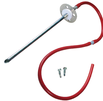
Total Pressure Probe Assembly (Total Probe and Static Probe Assemblies are sold together as the Pitot Pressure Probe Assemblies, ZPS-ACC11 or ZPS-ACC12)