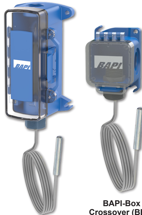
BAPI-Box Crossover (BBX)